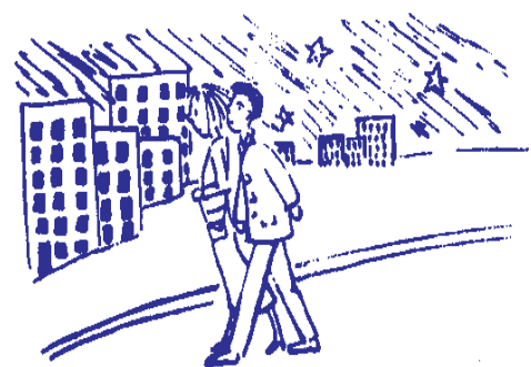
We had to walk home.